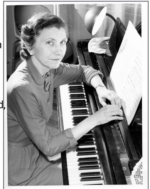
Violet Archer at her piano.

We at the Parkallen Community Association hope that you and yours have a beautiful holiday season. We appreciate each and every one of our residents and we thank you for making our community spectacular. We'll see you in 2021!